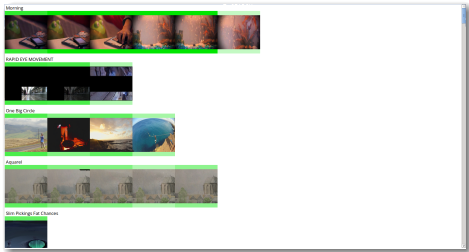
Fig. 2. Screen-shot of the corresponding result page